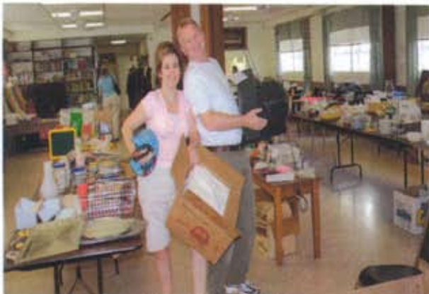
Flea Market Shoppers